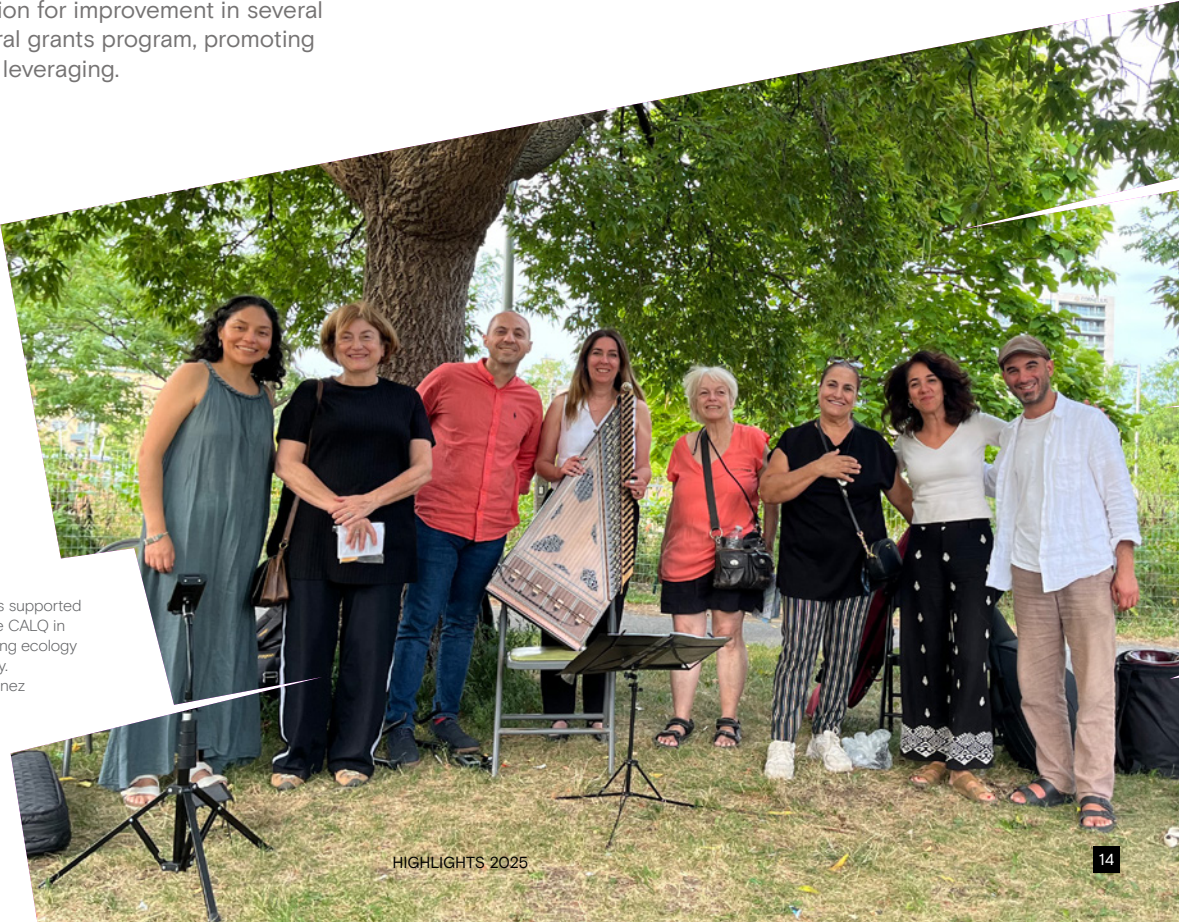
Ensemble Caprice is supported by the CAM and the CALQ in its projects combining ecology and cultural diversity.

2022-2025 RESULTS Environmental responsibility was one of the new axes of the 2022-2025 Strategic Plan, reflecting the desire to align public support for the arts with contemporary environmental and social issues. By aiming to integrate eco-responsible criteria into 100% of the relevant programs, the target was achieved.