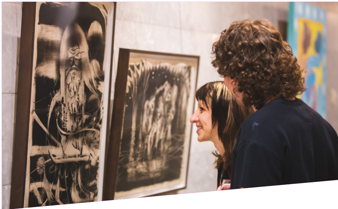
Opening of the exhibition Le corps n'en finit jamais de dire at the Maison du CAM

2022-2025 RESULTS Despite a budget freeze pushing the $25 million target to 2026, financial performance remains strong. Partnership revenues have increased while Maison du Conseil revenues have doubled since 2021. These results attest to the Conseil's ability to diversify its revenue streams.