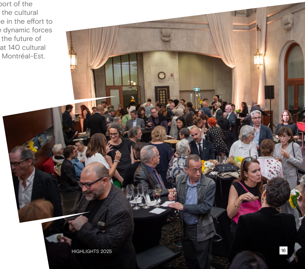
Inaugural Consécration evening

Behind every artist and artistic organization are professionals whose commitment has shaped the artistic vitality of Montréal. As part of a process of memory and recognition, the CAM expresses its gratitude to these people who have left a lasting impression on the cultural face of the city.