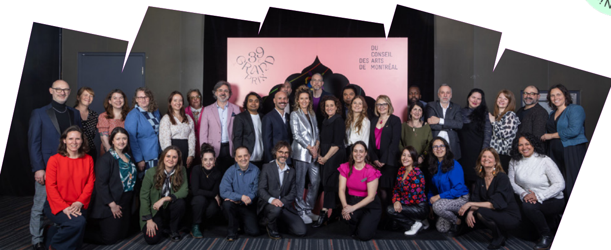
The Council team at the Grand Prix